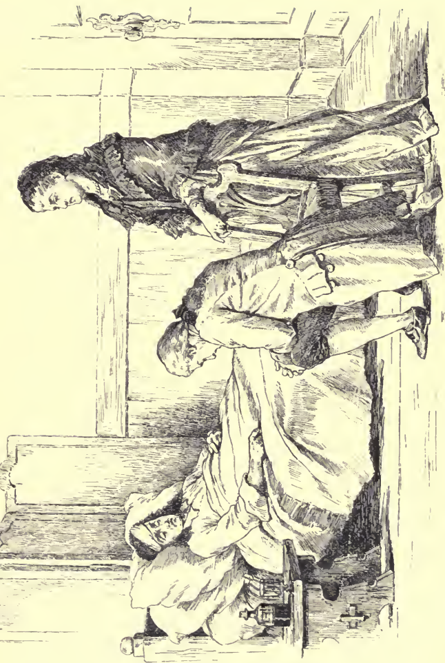
'As he rose from his knees, he was surprised to see Lady Annaly standing beside him.'